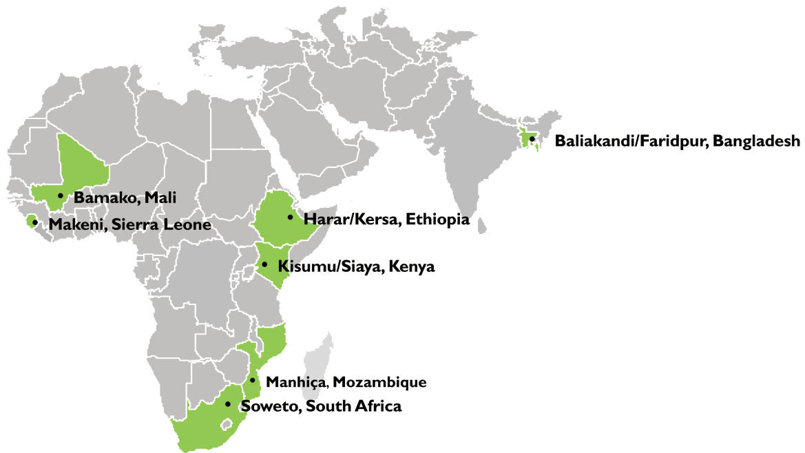
Figure 3. Map of Child Health and Mortality Prevention Surveillance sites. Abbreviation: CHAMPS, Child Health and Mortality Prevention Surveillance.

To monitor demographic trends and calculate mortality rates, most sites conduct surveillance within a health and demographic surveillance system (HDSS). An HDSS